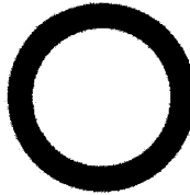
25620 No. 115